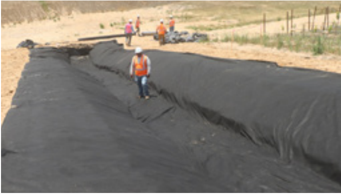
Figure 1: Geotextile placement in excavation

Step 1: After completion of excavation, install the nonwoven geotextile liner across the bottom and up the sides of the excavated area. Pins or stakes may be needed to temporarily secure the nonwoven geotextile to the excavated area (Figure 1).