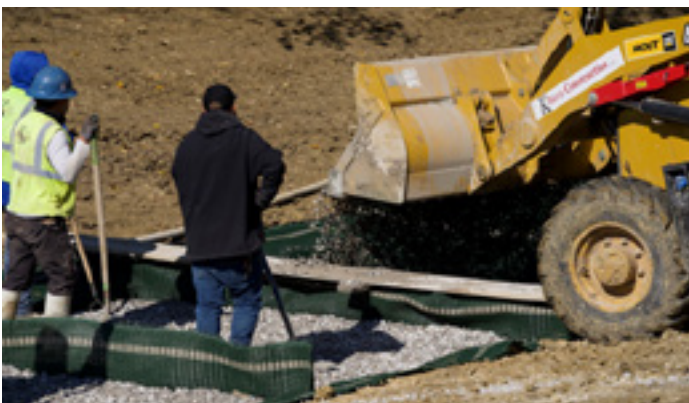
Figure 5: Overview of filling Mattress System

Step 7: To construct additional internal baffles, cut a 3.5 ft (1.1 m) wide strip of the and follow the process shown in Step 7. Once constructed and placed, all additional baffles should be secured to the lower HPTRM layer with synthetic stakes on 2 ft (0.6 m) spacing. Any excess material on the sides of the internal baffles can be folded toward the upstream direction of the channel and pinned to the side of the excavated area through the HPTRM (Figure 4).