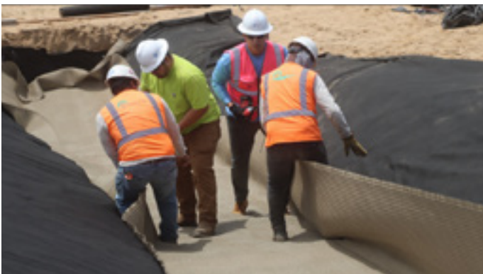
Figure 2: PROPEX Landlok HPTRM placement in bottom of excavation

Step 1: After completion of excavation, install the nonwoven geotextile liner across the bottom and up the sides of the excavated area. Pins or stakes may be needed to temporarily secure the nonwoven geotextile to the excavated area (Figure 1).