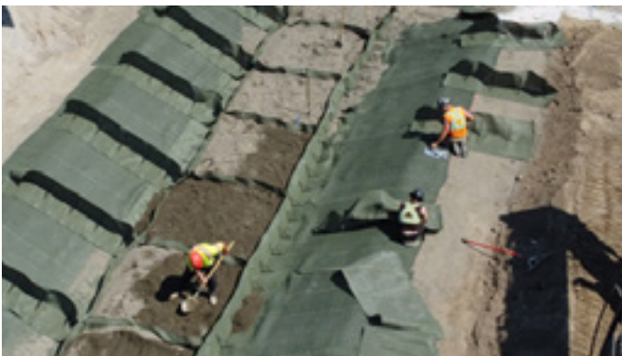
Figure 3: Overview of weaving braces in baffles

Step 5: Once the bottom layer of HPTRM has been placed, internal baffles are to be constructed with the PROPEX Pyramat 75 HPTRM material facing downstream along each overlap. Additional HPTRM baffles are to be constructed and placed facing downstream to maintain a maximum baffle spacing of 8 ft (2.4 m).