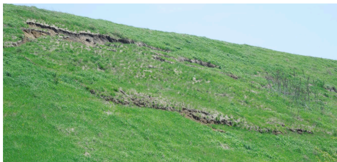
Figure 1 - Slope Failure

A slope becomes unstable causing a soil mass to mobilize when the shear stress acting on the soil becomes greater than the shear strength of the soil. There are many factors that can affect the shear strength of soil and many circumstances can place additional shear stresses on soil. Due to the large amount of variables impacting the stability of a slope it is almost impossible to find the sole cause of slope mobilization. The implementation of measures to correct one or two key failure mechanisms, however, has been effective in slope stabilization. While erosion, the detachment, transportation, and deposition of soil particles, can be a factor affecting slope stability it must be differentiated from slope failure, the mobilization and sliding of a large soil mass (Figure 1).