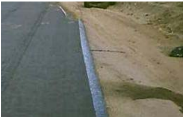
Figure 4: Tack coat spray width beyond fabric