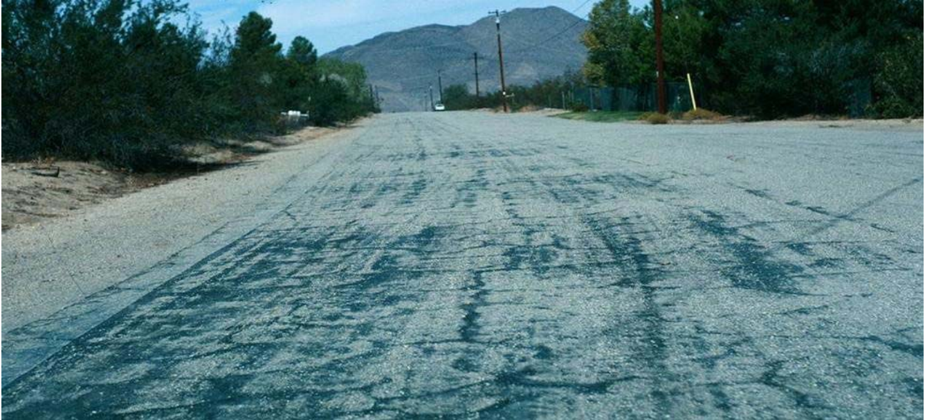
Figure 11: Saturated fabric with broadcast sand