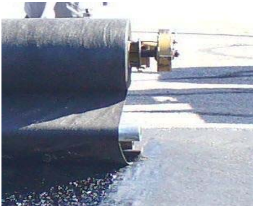
Figure 7: Longitudinal overlap

Transverse joints and longitudinal overlaps that are not installed as described above shall be trimmed to meet the correct dimensions.