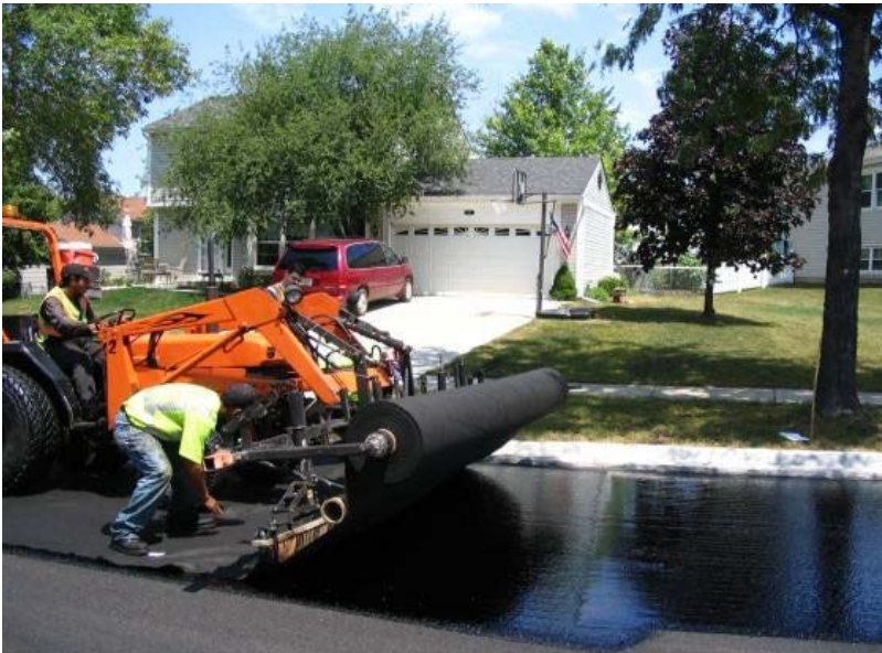
Figure 6: Tractor mounted equipment