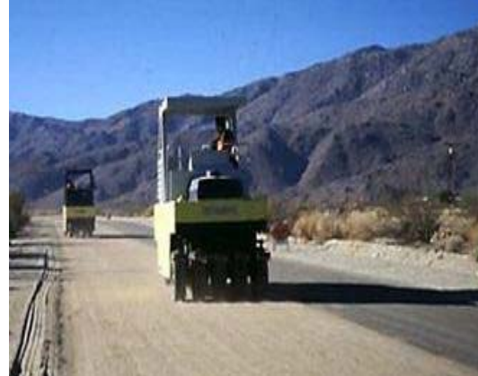
Figure 10: Rolling