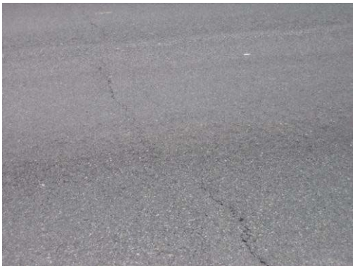
Figure 2: Recommended Application rate - 0.25 gal/yd 2