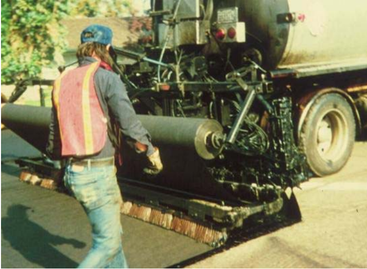
Figure 5: Distributor mounted equipment