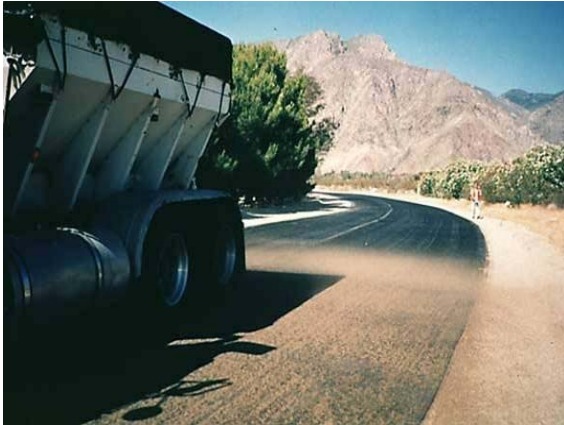
Figure 9: Spreading sand