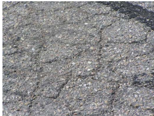
Figure 3: Recommended Application rate - .33 gal/yd 2

The tack coat application rate should be checked at the beginning of, and during the installation process. This is accomplished by placing the asphalt cement and paving fabric, then sanding and rolling a short section and inspecting the surface for saturation. The surface texture after fabric installation should reflect the texture of the underlying pavement and the paving fabric should be visibly saturated with the asphalt cement.