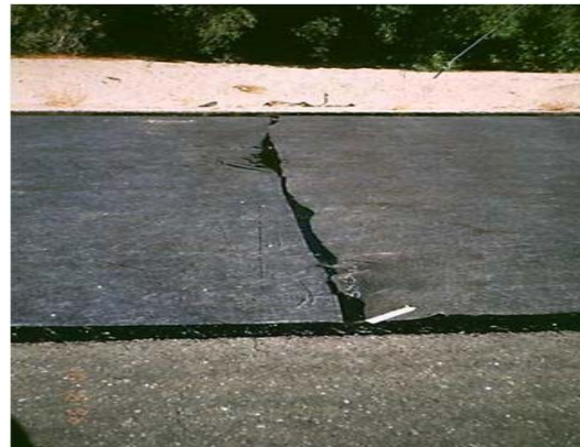
Figure 8: Transverse joint