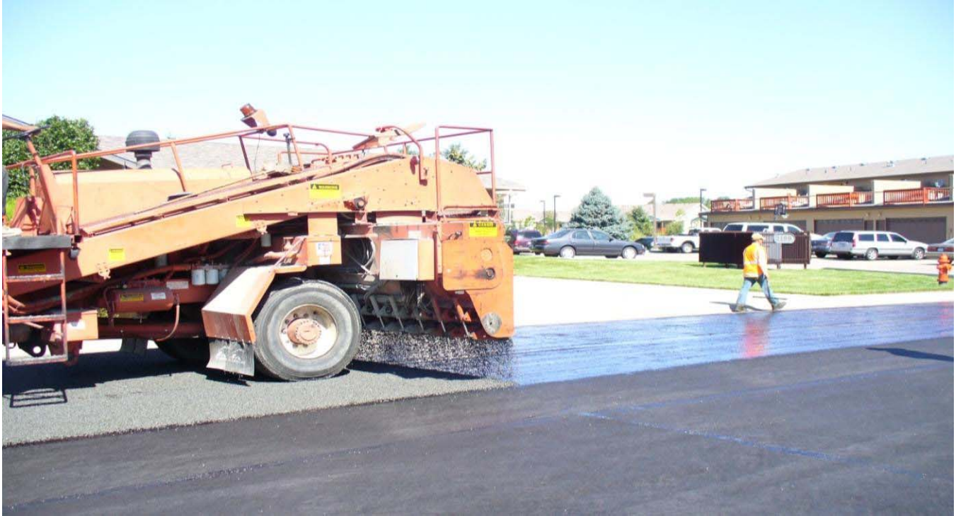
Figure 12: Chip seal installation over installed paving fabric

The NCHRP Synthesis 342, “Chip Seal Best Practices”, provides an overview of successful chip seal practices in the United States, Canada and Overseas. It contains a list of references of available chip seal site selection and design methods, including chip seals with paving fabric interlayers. The NCHRP Chip Seal Best Practices document and all of the references at the end of this document can be obtained from your regional TenCate representative.