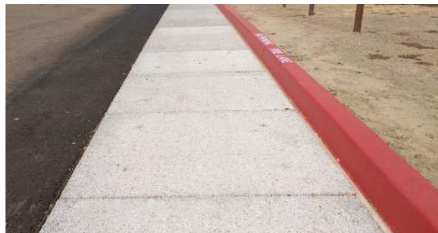
STORMCRETE GUTTER APPLICATION

Have questions? Contact your local Ferguson Stormwater/Geo Specialist or Green Stormwater Infrastructure Specialist for assistance with your next design. Visit fergusongss.com .