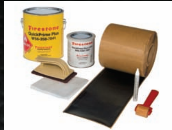
Firestone Geomembrane systems are complimented by a full line of accessories.

Please visit our Web site for the most current technical information.