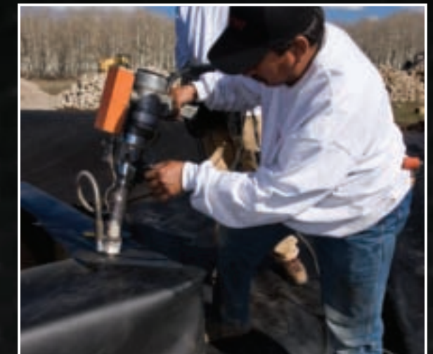
All Firestone Geomembrane systems exhibit excellent conformity for ease of installation.