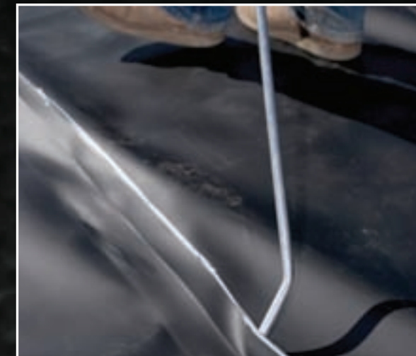
All Firestone seams meet ASTM D4437 standards.