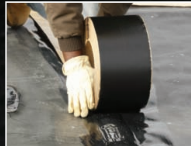
Firestone's QuickSeam Tape provides dependable seams without requiring utilities or special tools.