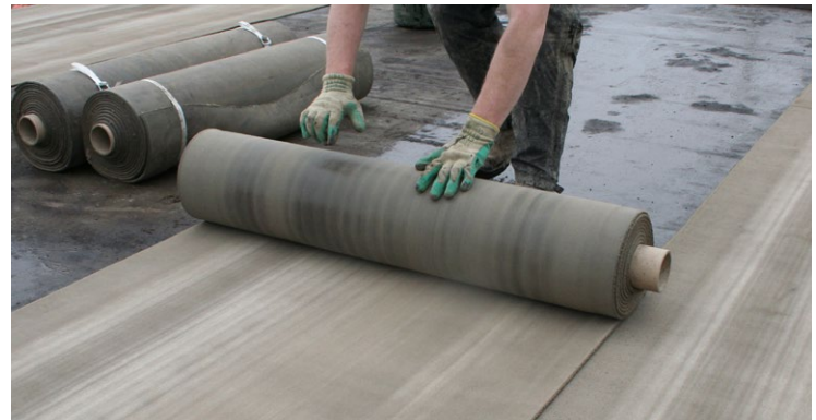
CC Batched Rolls