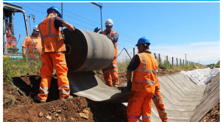
CC Bulk Roll